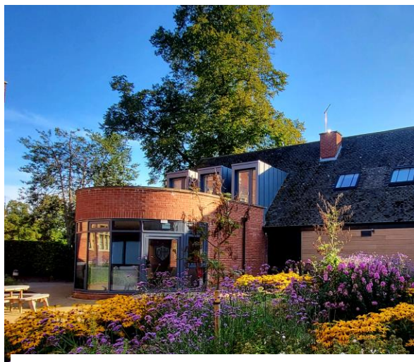
Ottlie Hild House in the late summer sunshine