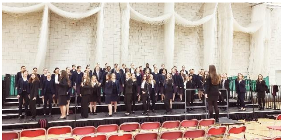
House Song rehearsals